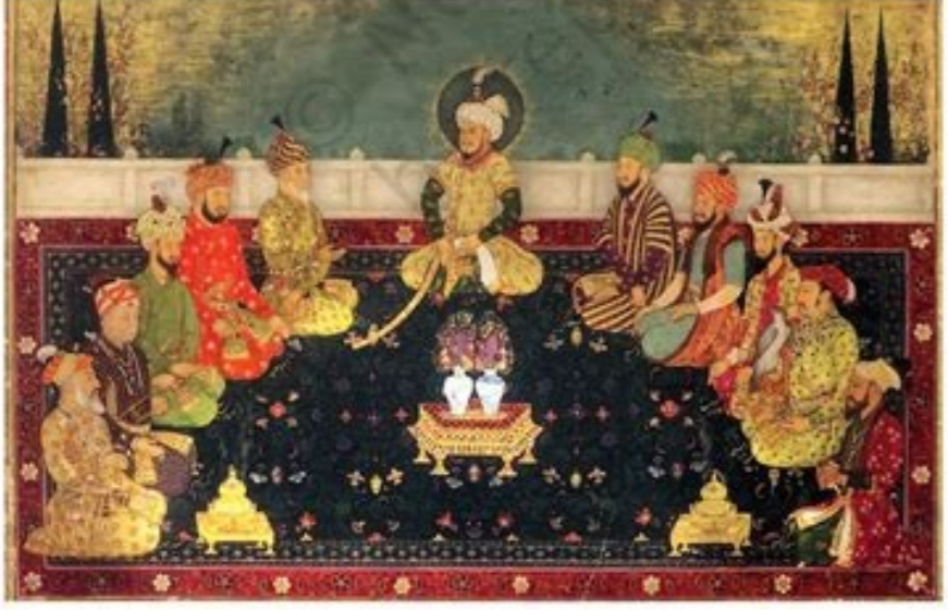
OUR PASTS - II 46