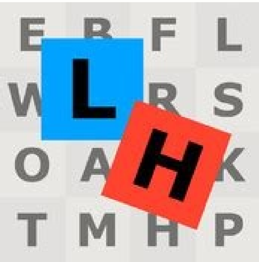
Word sandwich game answers. Win word games.